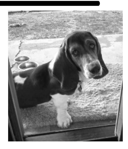
9 month old, Gus... Wouldn't you do anything for this face?

Just use these links when shopping around. <a href="http://www.goodsearch.com">http://www.goodshop.com</a> or shop <a href="http://www.goodshop.com">http://www.goodshop.com</a> .